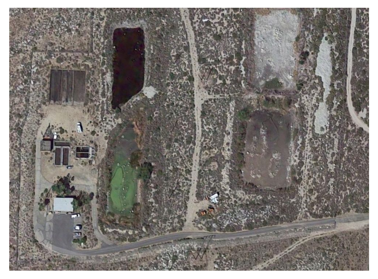
Figure 1: Aerial view of the wastewater treatment plant